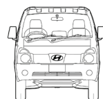
Overall width 1 740 mm